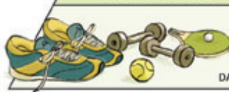
DAILY EXERCISE & WEIGHT CONTROL

WHOLE GRAINS: BROWN RICE, WHOLE WHEAT PASTA, OATS, ETC.